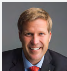
TIMOTHY M. KELLER