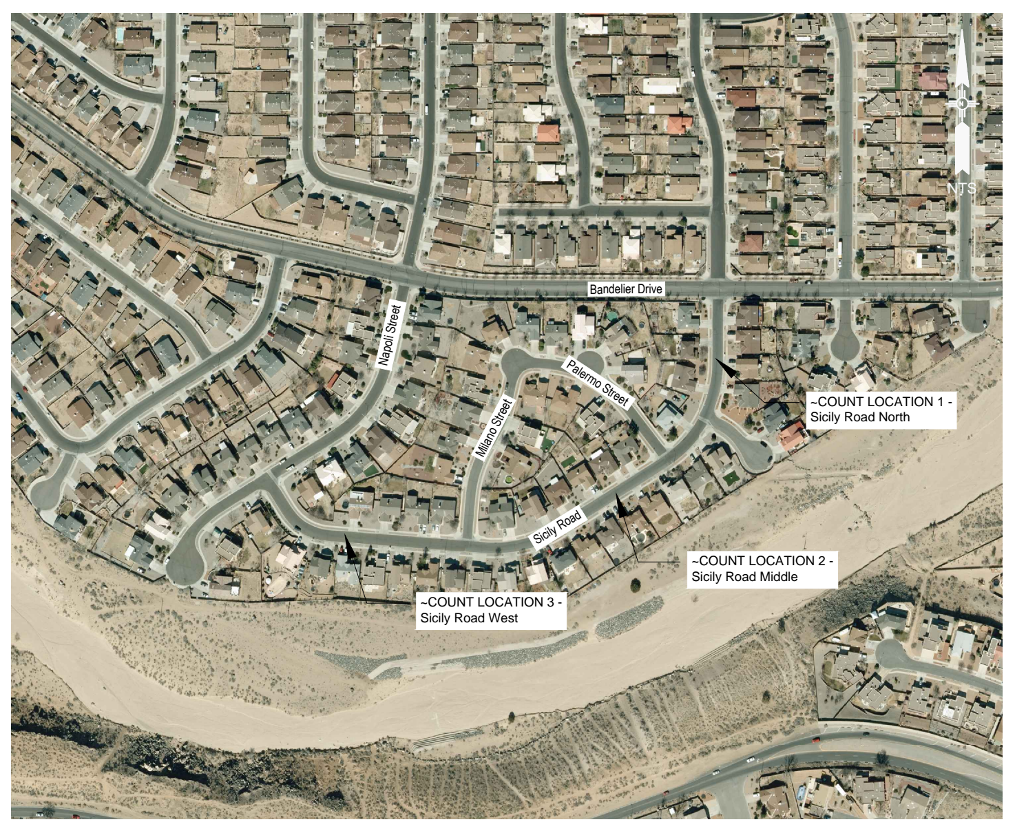
FIGURE 2.1. COUNT LOCATIONS