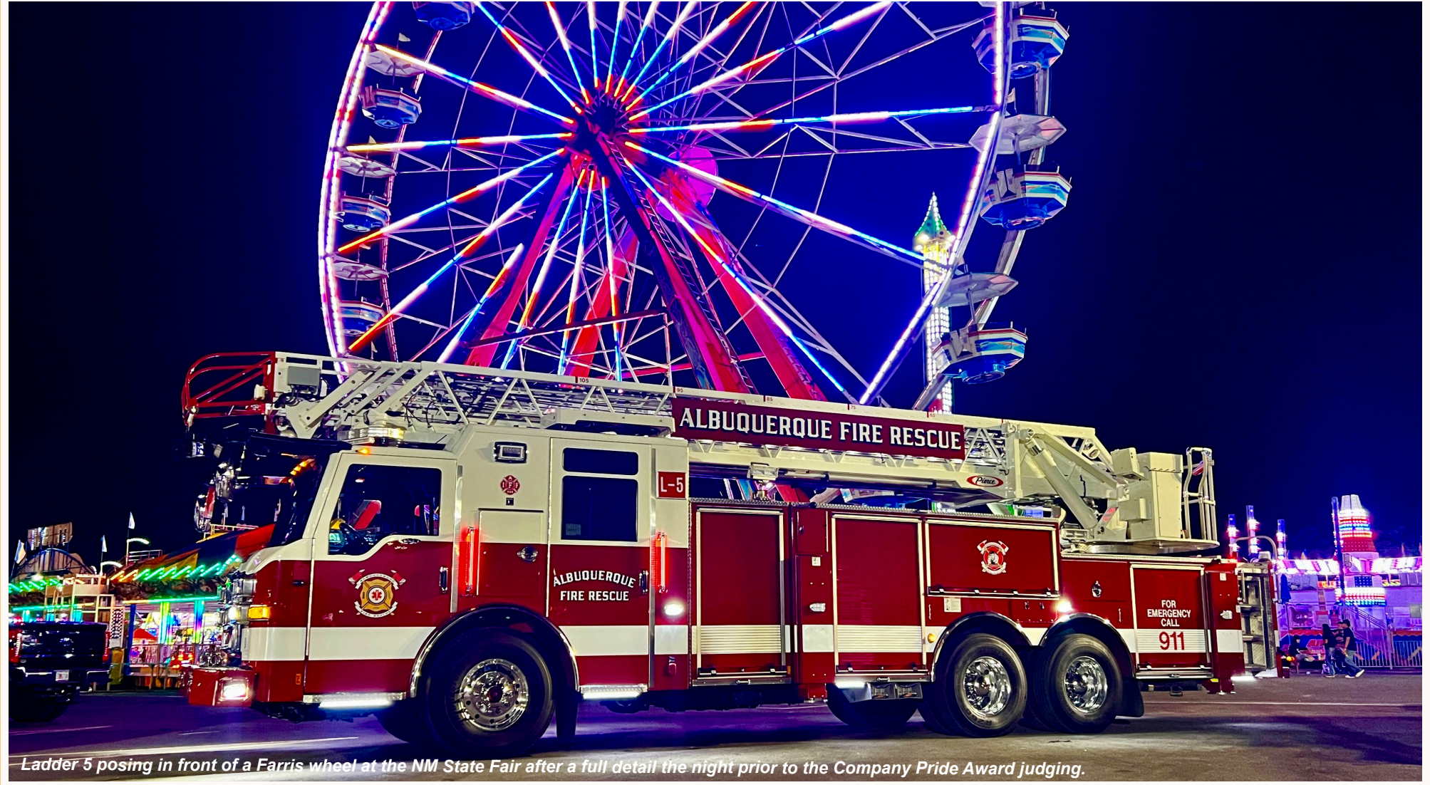
Ladder 5 posing in front of a Ferris wheel at the NM State Fair after a full detail the night prior to the Company Pride Award judging.

Albuquerque Fire Rescue is transitioning to the P1 CAD software. Call volume data will be delayed until this information is able to be collected.