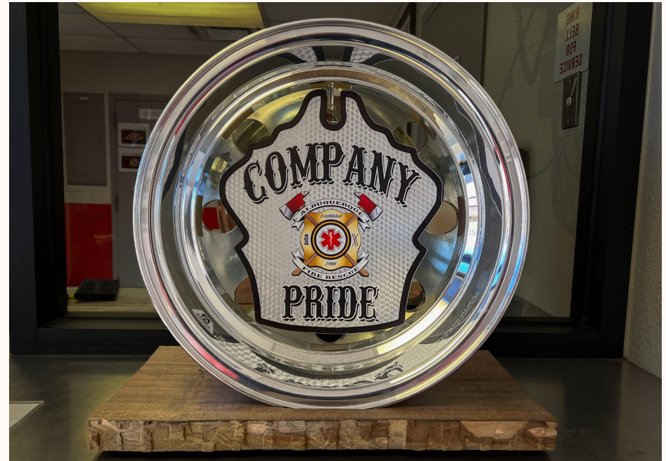
The AFR Company Pride Trophy will soon be awarded to the 2024 recipient that presented the cleanest fire apparatus. This year's apparatus that entered the contest were Engine 1, Squad 2, and Ladder 5.