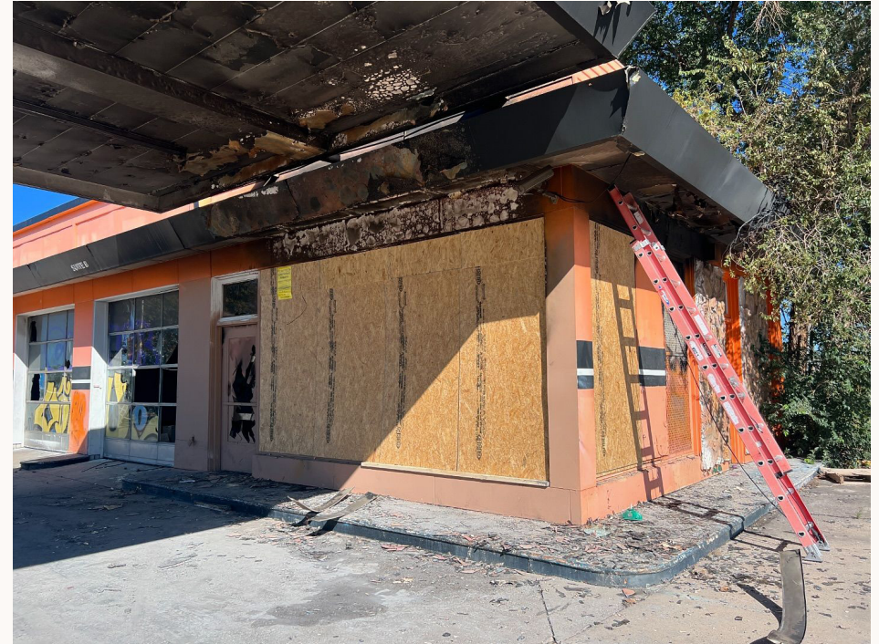
The aftermath of fires at Apache NE on 9/30 (left) and Central NW on 9/4 (right).